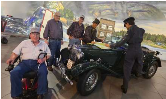
Fagen's World War II Museum